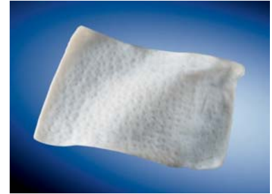
Bard* AlloMax* Surgical Graft

After positioning the patch posterior to the esophagus, interrupted sutures of 2/0 ETHIBOND* were used to fix the perimeter of the graft along the medial, lateral and anterior edges. Loose approximation of the patch anteriorly over a 60 French bougie was achieved. The anterior leaflets of the patch were drawn toward one another anteriorly, but not overlapped. A Dor fundoplication was then performed.