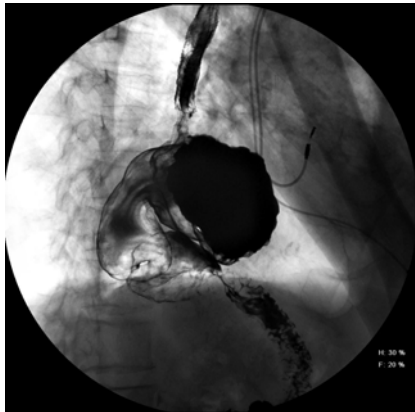
Pre-operative Barium Swallow

The Bard* AlloMax* graft was easily tailored to fit the patient's anatomy and affixed with standard suturing techniques. As of six months, despite being used as a bridge over a small diaphragmatic defect, the repair has remained intact.